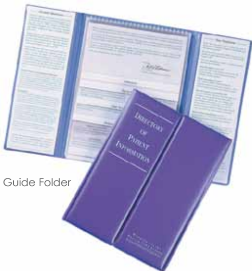
Room Guide Folder